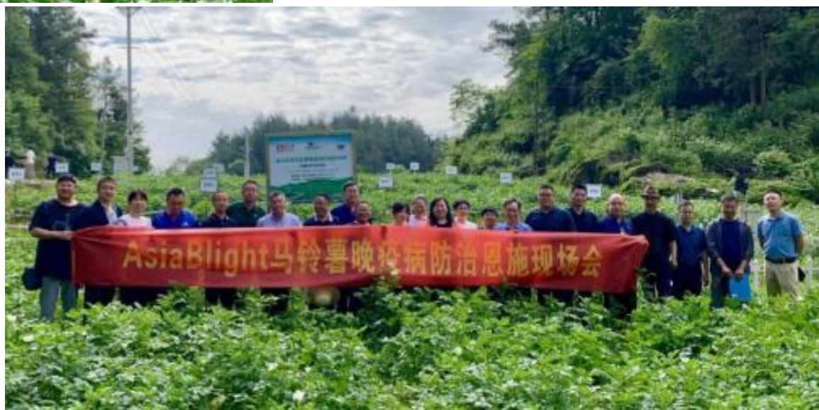
Capture: China Southern Potato Research Center of Enshi in Hubei Provincce